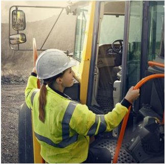
Swecon Business Area