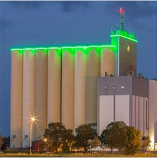
Real Estate Business Area